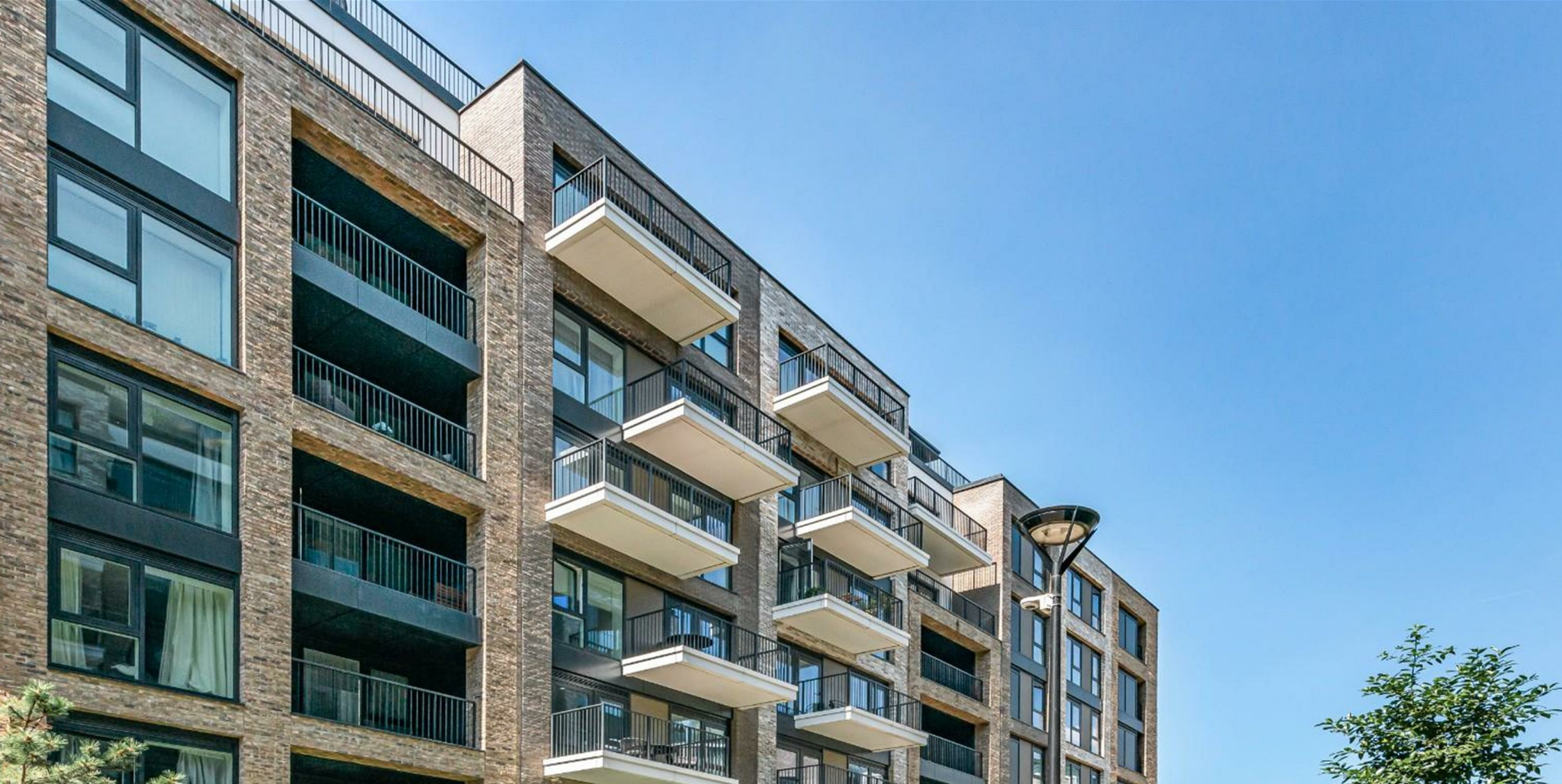
Westwood Building, Chelsea Creek Fulham SW6